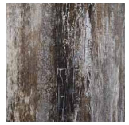
INTRIGUE H61 RIO