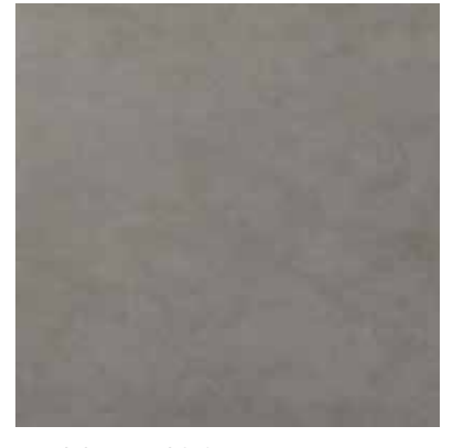
ANGORA H62 SUPERMAT