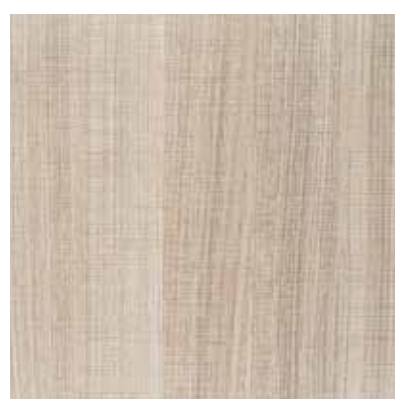
STRATA H64 RIO