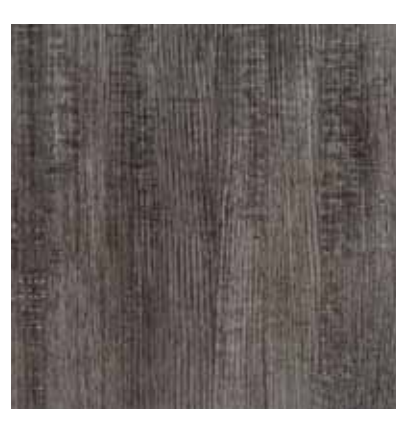
VINTAGE H66 RIO