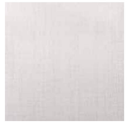
MOSAIC H63 DOLOMITE