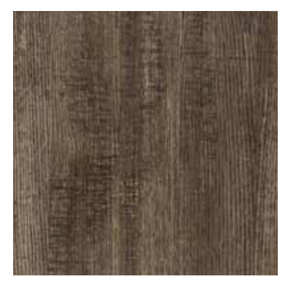
CANYON H65 RIO