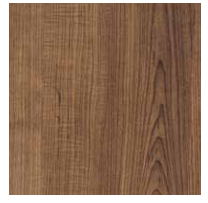
CLASSIC SPICE H60 DOLOMITE